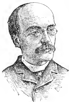
JOHN BACH MCMASTER.

H ISTORY OF THE PEOPLE OF THE UNITED STATES, from the Revolution to the Civil War. By JOHN BACH MCMASTER. To be completed in six volumes. Vols. I, II, III, and IV now ready. 8vo. Cloth, gilt top, $2.50 each.